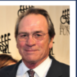
TOMMY LEE JONES